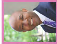
Overture Walker District 8