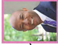
Overture Walker District 8